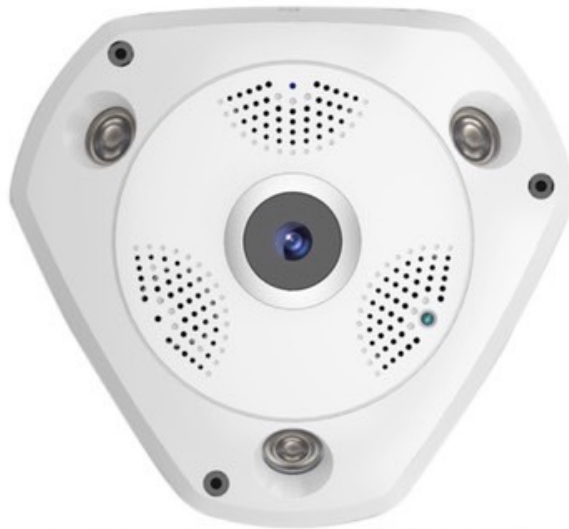
Ceiling Camera HD 720P-AHD

It is our hope that with the support and oversight of management, most passengers who exhibit dangerous or unlawful behaviors and damage to the vehicle seats, can be reminded with warning decals and by the drivers: "For your safety and security, this vehicle has a video surveillance system in use" recording what occurs on the vehicle.