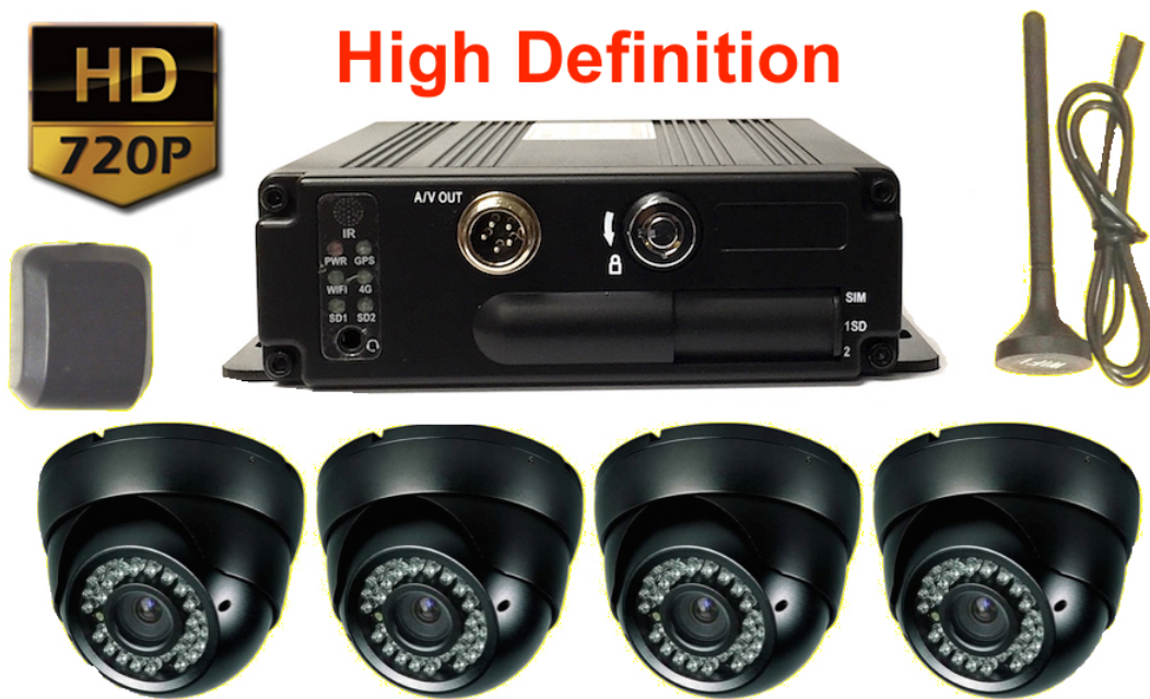
“SD4HW” Driver Safety & Passenger Surveillance System