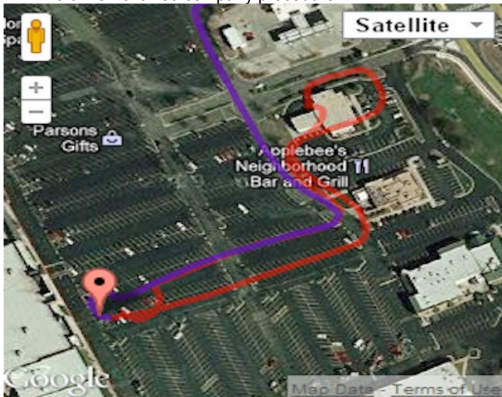
Route Traveled in Red, Route Returned in Purple