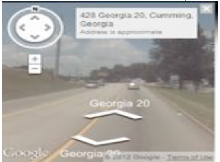
Goggle 360 degree Panorama View feature capable