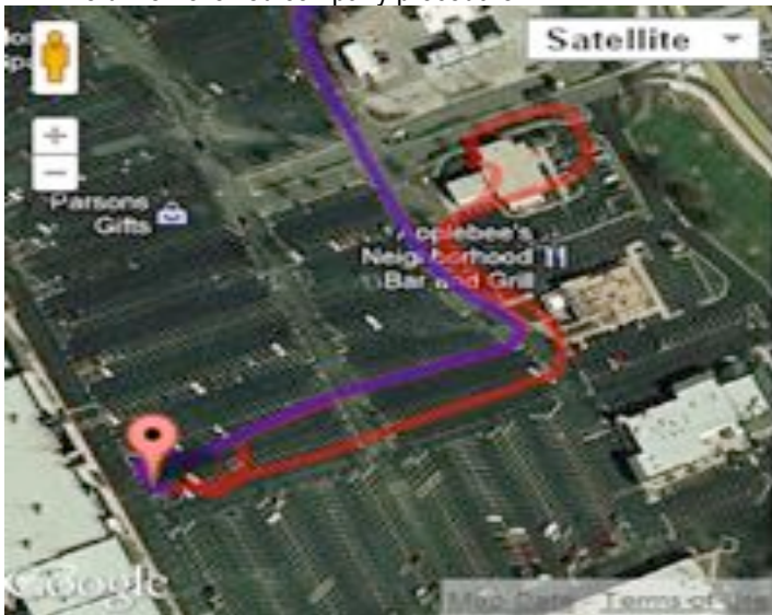
Route Traveled in Red, Route Returned in Purple