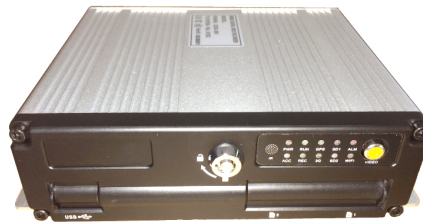
SD4D - Basic Series