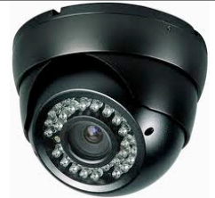
Choice of Cameras